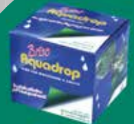
EXTENDABLE KIT 100 m 2